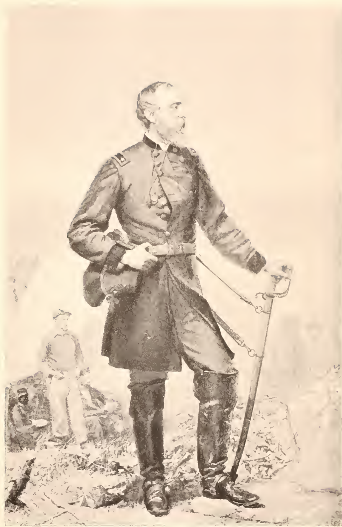
MAJOR GENERAL GEORGE G. MEADE, U. S. A.